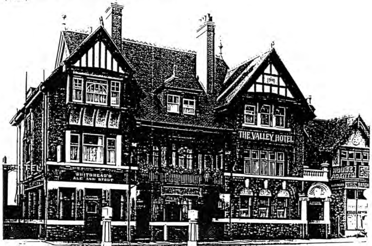
Fig. 1 The Valley Hotel, Caterham.

A photograph of the dragon (fig.2) shows a beast very similar to that on the former 'Railway Hotel', Great Western Street, Aylesbury, Bucks. The head of the Caterham dragon points down rather than horizontal; the mouth is closed rather than open; and the unicorn spike of the Aylesbury dragon is either replaced by a knob or broken off. The tail positions, the body posture, and the leg of the two beasts are virtually identical. The ridge of the tile at Aylesbury is horizontal; that at Caterham is elaborately crested. (DHK)