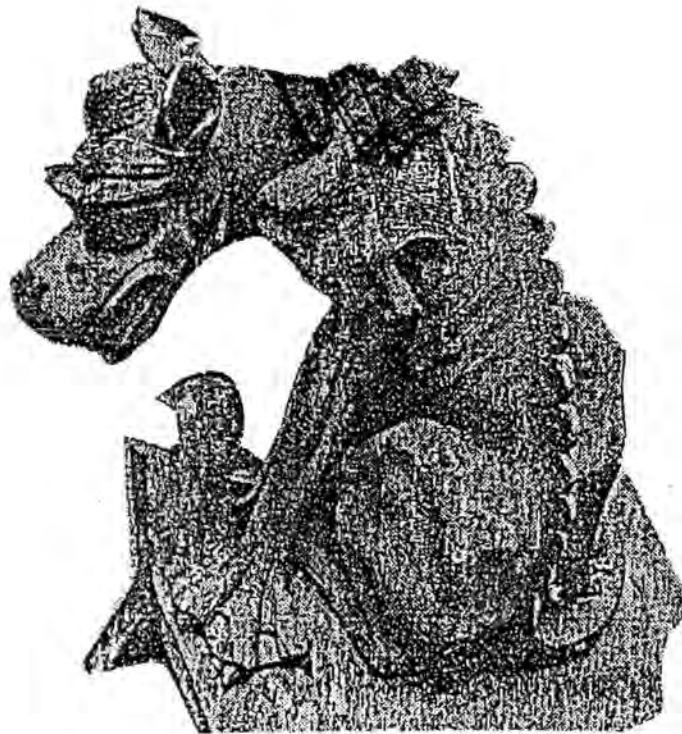
Fig.2 The dragon from 'The Valley Hotel', Caterham. Note the crested back repeated on the crested ridge of the tile. Note also the bat-like feet of the front leg.